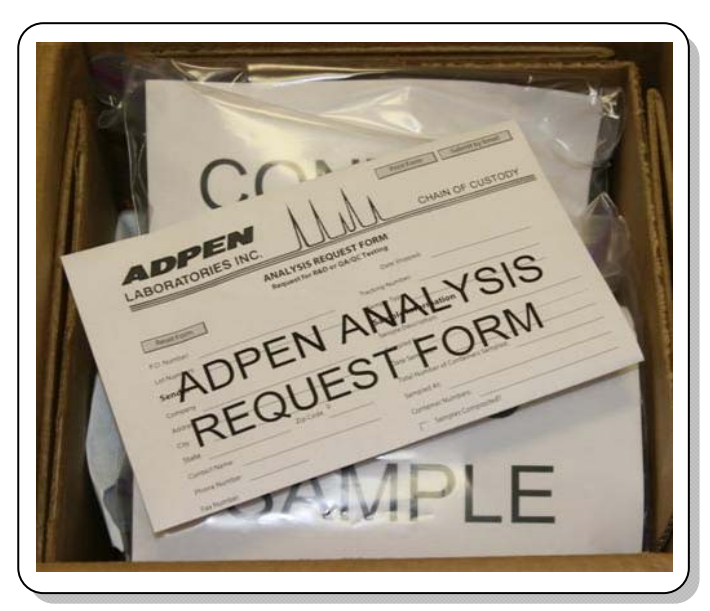
b. When submitting multiple samples in the same box, please secure the ARF in a separate plastic bag inside the box.

a. Separate samples by placing them in individual bags or containers to prevent cross contamination. Include a control sample if required.